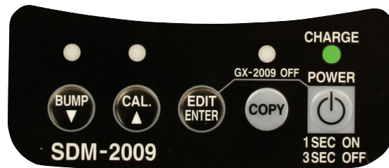
Control Panel View